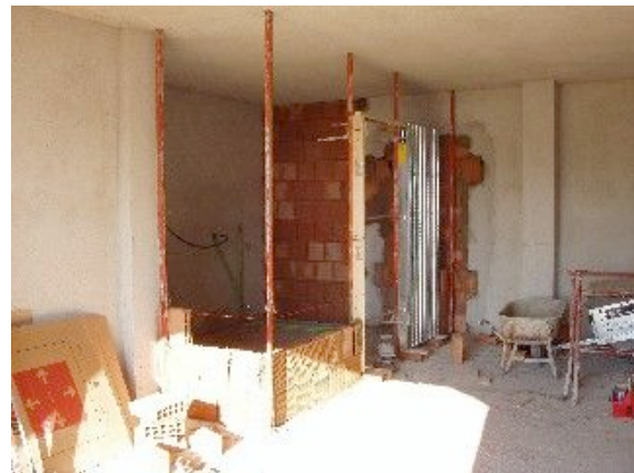
...and here it is taking shape - believe me now??