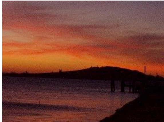
The lake, more birds and the full sunset - envious yet?!?!?