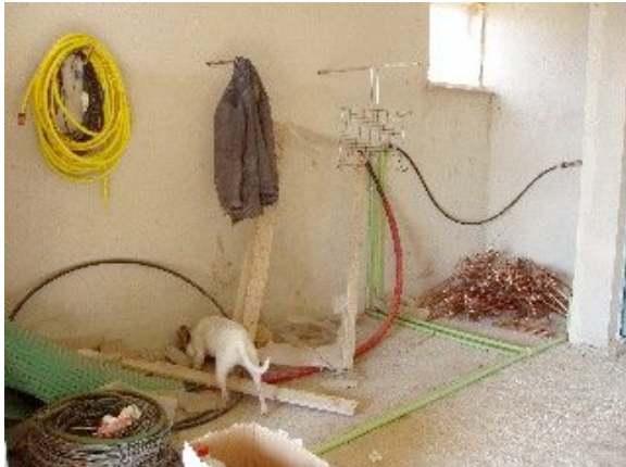
Believe it or not, this will be a shower-room with facilities for family or disabled guests!