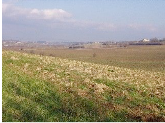
And the view - WOW!!