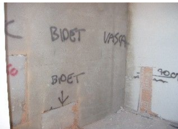
Vasca = Bath, Bidet you already know - so it's a bathroom in the making...