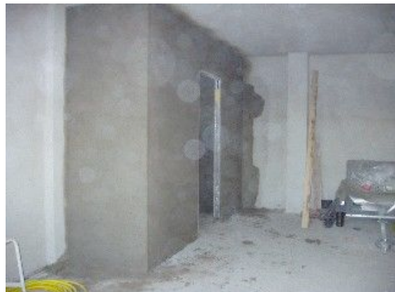
Back to the shower-room in Suite 1, also more finished off.