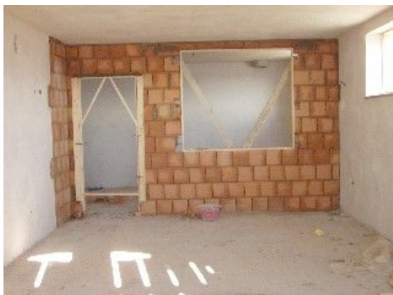
The new wall for the kitchen (far end) the guest lounge-dining room this end.