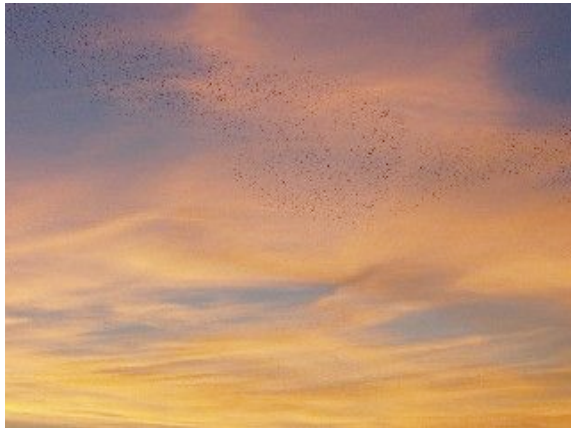
OK, it's not the house, but if you look closely, thousands of tiny birds at sunset (over Lake Trasimeno).