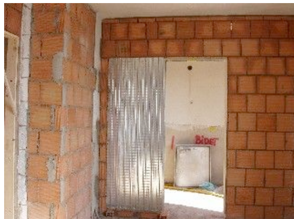
The new walls for Suite 2, with a sliding door into the bathroom - the silver thing here.