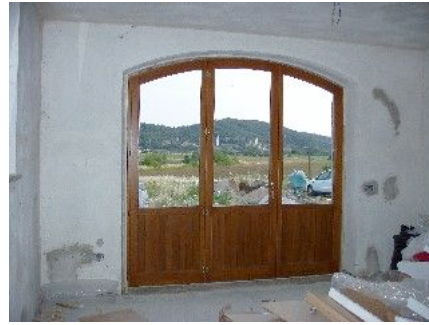
A view from the guest lounge/dining room, which will be even better when decorated - not long now...