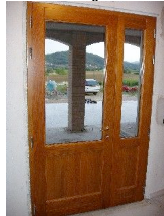
Not to miss out on the front door, sheltered under the portico. All these doors open fully and are tailor-made of beautiful chestnut wood.