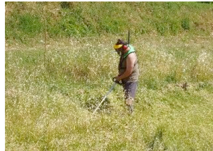
And this?? No, not a creature from outer space, it's Derek working hard to tame our chaotic field - which will, one day, be a lovely garden!