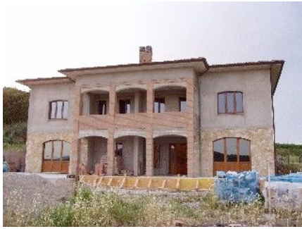
Notice the difference - gone are the anonymous holes - we now have windows and doors!