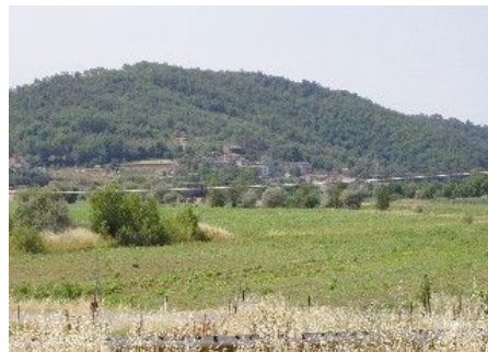
These fields may be green and a little boring, but come in September and see them full to the brim with luxurious sunflowers!