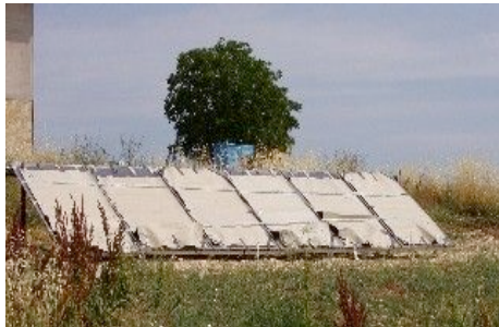
Any guesses?? Well, the newly-fitted solar panels of course!