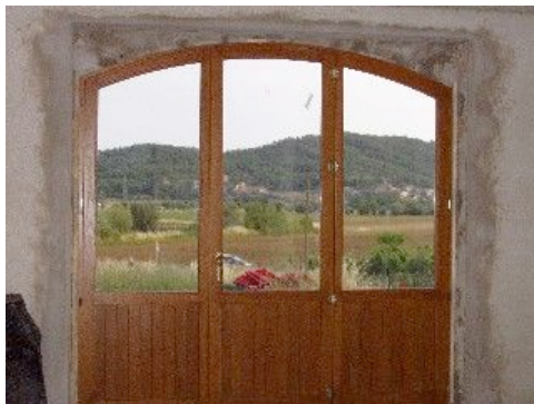
... and to complement a view from Guest Suite 1, on the left of La Serena as you look at the front.