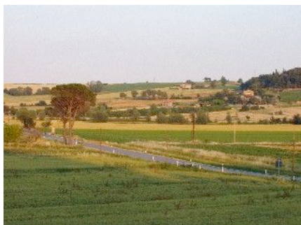
This was taken in late April, the field at the bottom is already golden brown wheat, ready to harvest - in early July already!