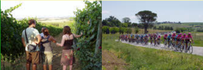
Local Wine-tasting Tour