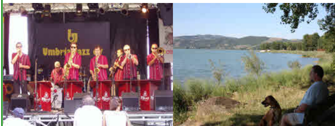
Umbria Jazz Festival: July & December