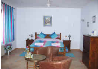
The Ortensia Suite

Your relaxation and comfort starts in your suite or room, with private balcony or terrace, luxury en-suite bath or shower-room and lots of comfort features, including tea/coffee facilities, hairdryer, free toiletries - and lots of useful information .