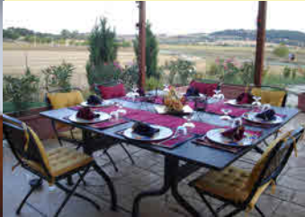
Breakfast or Dinner on the Sun-Terrace

"Staying at La Serena was the best experience, totally home away from home. We will definitely be back - and for longer next time!"