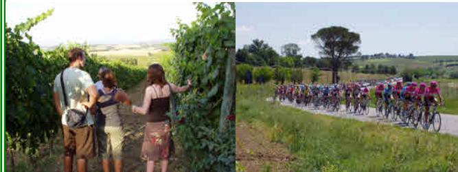
Local Wine-tasting Tour

Learn a new skill or develop an existing one and meet new, like-minded, friends on our Special Interest (Activity) Holidays , or come as a group for loads of fun!