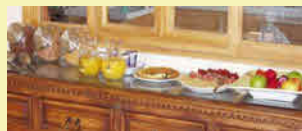
Extensive buffet breakfast included

2010 Prices are €85 per room, €95 per suite for 2 people sharing including breakfast, when staying for at least 2 nights. Extra charges apply for children sharing, single-night stays, etc.