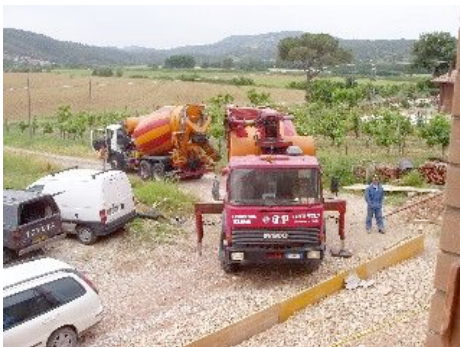
This was a very exciting day for us - two concrete mixer lorries, full of cement - just for our house!! Not exiting for the builders though..