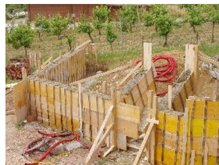
All finished. A few days later all the boarding was removed... all the wall needs now is a coat of rendering - any offers????