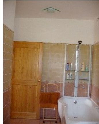
You've seen our bathroom part-tiled. Here is the finished result - after we've decorated and added light fittings...