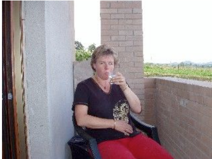
I went for the traditional (glass) approach!