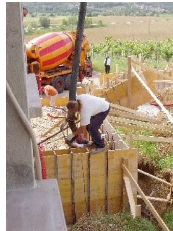
This is Darco - risking life and limb to fill in the retaining wall on the west side of the house - all ready for the swimming pool...